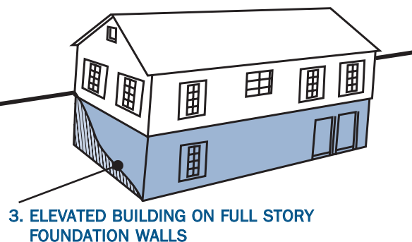
3. ELEVATED BUILDING ON FULL STORY FOUNDATION WALLS

When a building is elevated on foundation walls, coverage limitations apply to the “crawlspace” below.