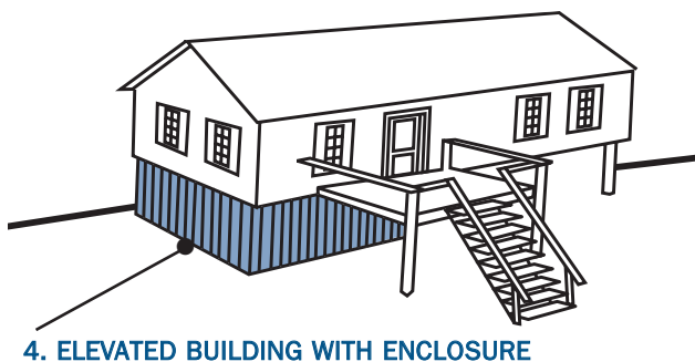
4. ELEVATED BUILDING WITH ENCLOSURE

Coverage limitations apply to the enclosed areas (lower floor) even when a building is constructed with what is sometimes called a “walkout basement.”